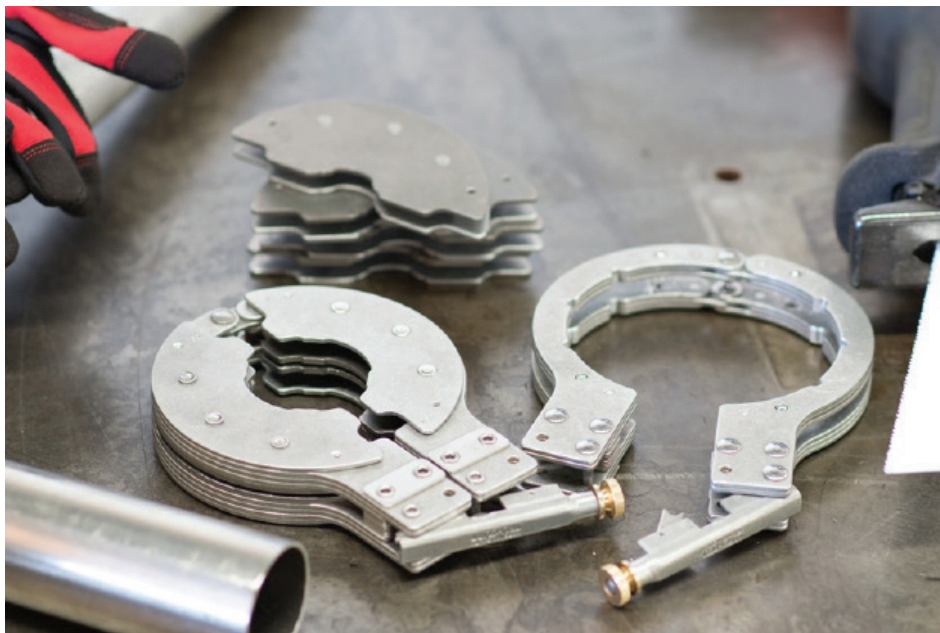
Tru-Cutt 3" master frame and precision cutting guides. Designed and manufactured in the U.S.A.